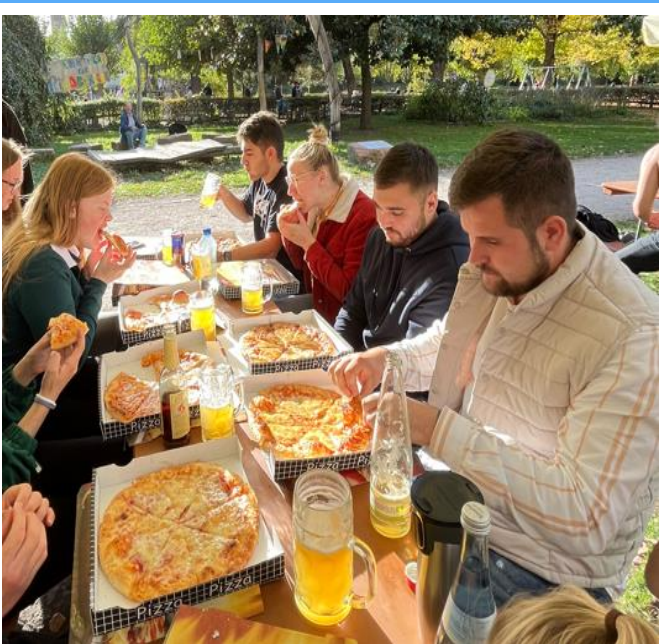
SPONSORED BY THE